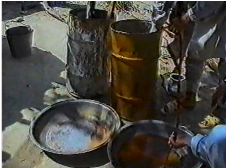
Figure 1 - Barrels, metal bowls and other basic equipment in a drugs lab in Afghanistan. This picture shows calcium morphine solution being drained into bowls.