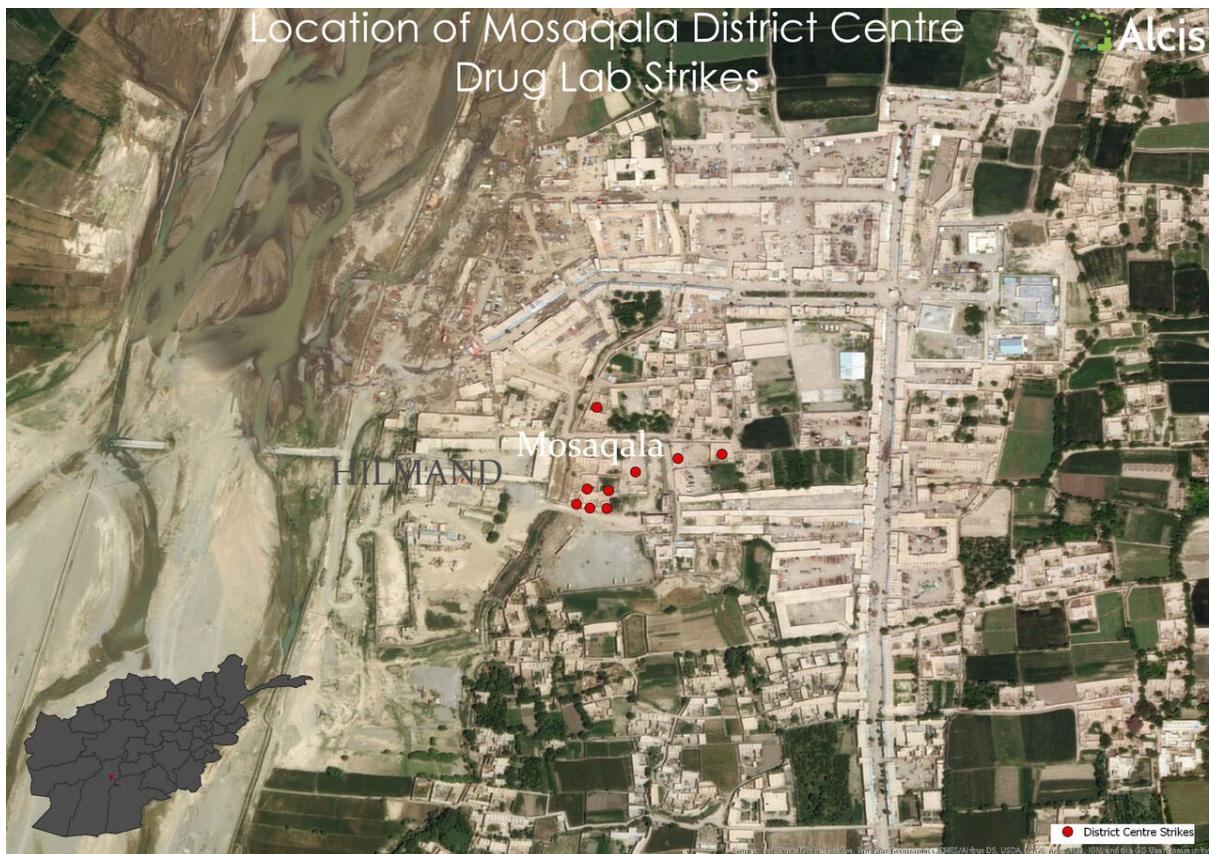
Figure 5 - Image of Moosaqala district centre showing the location of the air strikes on 19 November 2017

elemental to the political economy of the country. Past efforts to prohibit opium production such as the Taliban prohibition of 2000/01 and provincial level bans, such as those in Nangarhar and the central districts of Hilmand, have proven unsustainable. The fragile political settlement that has underpinned these efforts has all too often collapsed due to a growing resistance from the rural population, community and tribal elites, and politico-military actors looking for support from the populous.