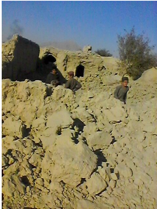
Figure 4 - Children playing in the ruins of one of the buildings destroyed by the air strikes on 19 November 2017, Moosaqala, Hilmand.