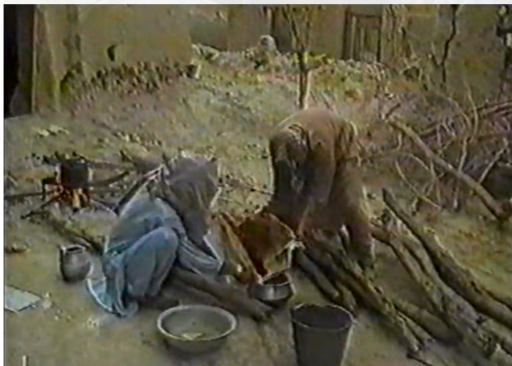
Figure 2 - Dried crude Morphine base being scraped from a cloth into an empty container in a drugs lab in Afghanistan.