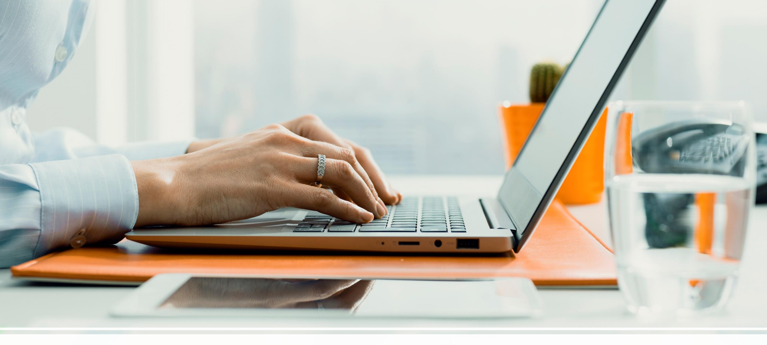
How to Apply and Admissions