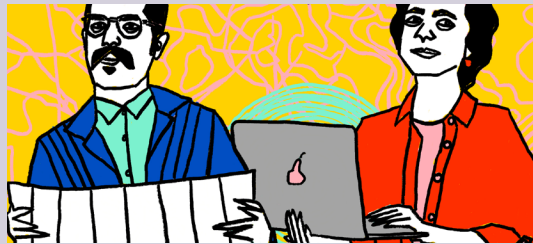
Archiving and Mapping Technologies in Palestine and Syria Season 3 Episode 5