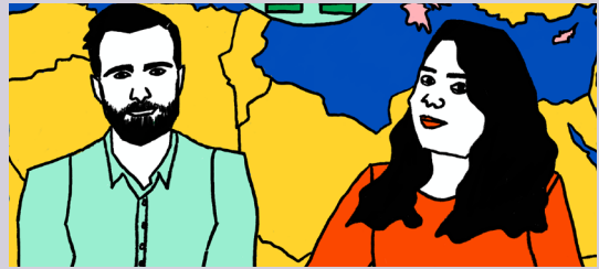
Re-Appropriating Technologies Season 3 Episode 3