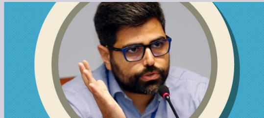
Serhun Al on Kurdish Movements, Peace and the Role of Researchers in Society Episode 6