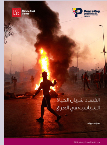
Sajad Jiyad's 'Corruption is the Lifeblood of Politics in Iraq'.