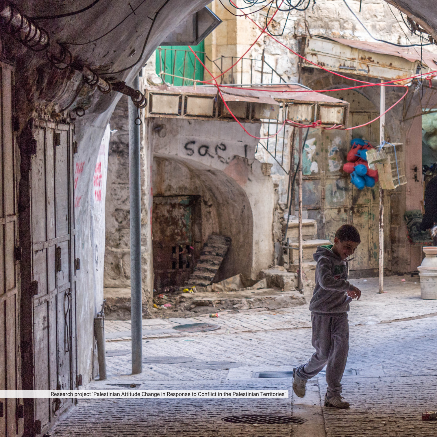
Research project 'Palestinian Attitude Change in Response to Conflict in the Palestinian Territories'