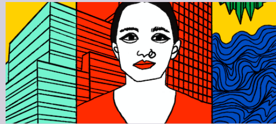
Living in the Future Season 3 Episode 7