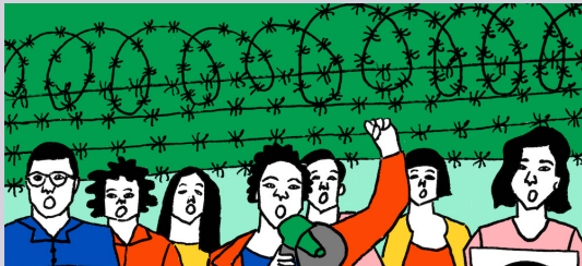
Digital Rights and Big Tech in MENA Season 3 Episode 1

This year saw the release of the third season of our Instant Coffee Podcast on the theme of technology. From fintech to drones, Abbasid-era paper production to the Anglo-Iranian oil company, this season explored technology is being applied, adapted and re-imagined in the region.