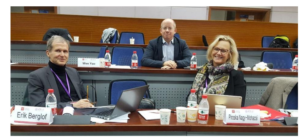
LSE IGA team at the workshop on Liberalisation and Financial Resilience in a Global Context, Tsinghua University