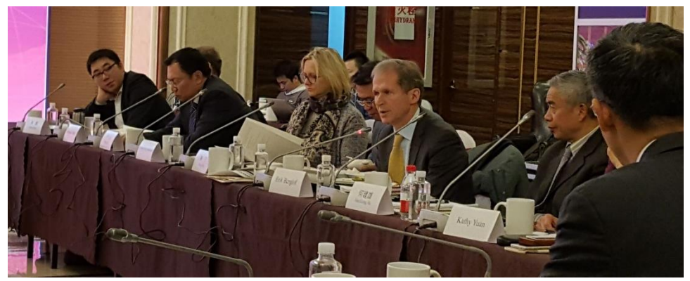
UK-China Financial Policy Initiative Project