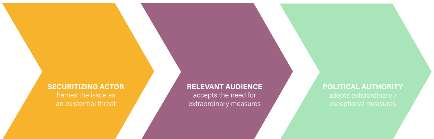
Figure 1: Securitization theory: How securitization occurs

In academic circles, the term securitization was popularized by scholars from the Copenhagen School of security studies (Buzan et al. 1998). According to their definition, securitization occurs when a securitizing actor frames an issue as an existential threat, the relevant audience accepts the need for extraordinary measures that break with normal rules and procedures to address that threat, and the measures are implemented (see Figure 1). Securitization effectively moves the issue from normal politics to exceptional politics. It can legitimate the use of emergency powers and the suspension of rights and freedoms to address the perceived existential threat.