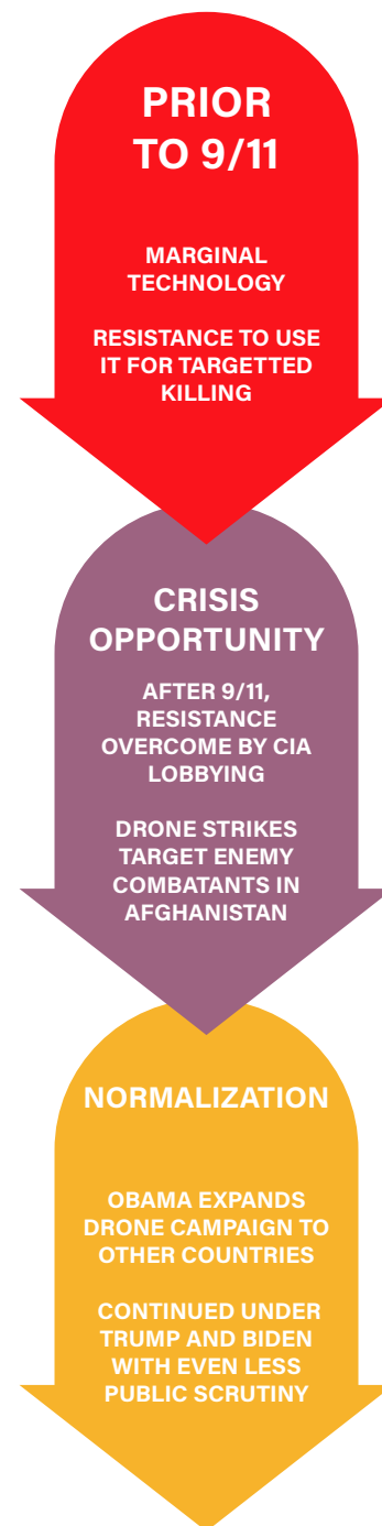
Figure 4: The Normalization of Drone Warfare

their towns without judicial authorization have become permanent. In addition to the systematic targeting of Muslims, these kinds of measures have been used against environment activists, trade unionists, refugee solidarity groups, and other civil society actors (Kilpatrick 2020).