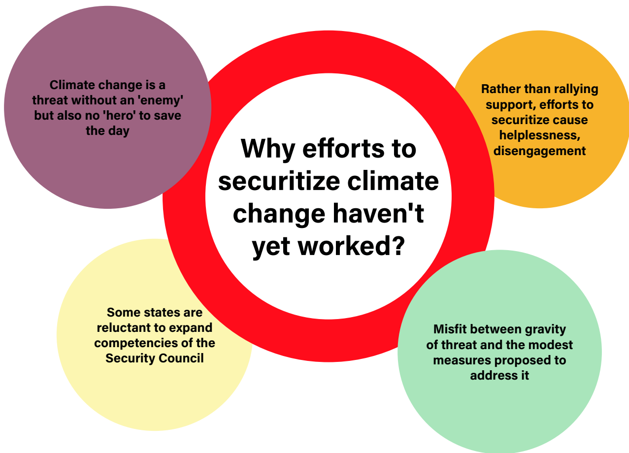
Figure 2. Climate Securitization Research: Why it has not worked so far

Researchers have applied this understanding of securitization to a range of issues including terrorism, migration, HIV/AIDS, drugs, and cybersecurity, among others. Climate change and the environment have attracted growing interest in the securitization literature. The research to date suggests that efforts to securitize climate change are on the rise both at the national and international level but so far, they have been largely unsuccessful in the sense that the sort of exceptional measures that securitization scholars predict have not been adopted. At the most, securitization efforts have resulted in politicization of climate change. Figure 2 summarizes some of the insights from academic research that seeks to explain why that may be the case. In addition to these explanations, a more general point is that powerful political and economic interests have been vested in denying that climate change is an existential threat and have been actively working to challenge efforts to frame climate change in those terms.