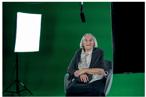
Images of the 'Histories of Belene' project courtesy of The Sofia Platform.