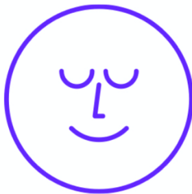
HAPPINESS AND WELLBEING