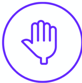
DEMOCRACY AND POLARISATION