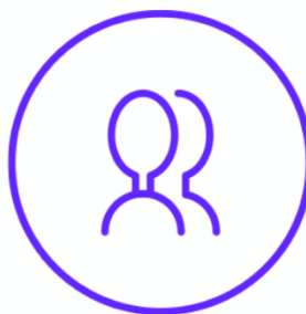
REFUGEES AND COHESION