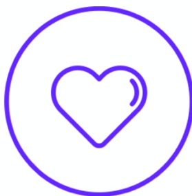
HEALTH AND SOCIAL CARE