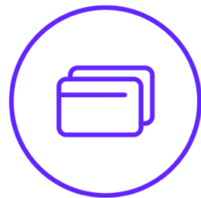
PARTICIPATORY AND EQUITABLE ECONOMIES